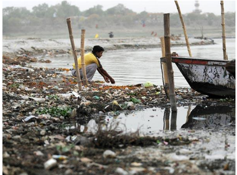
An Indian boatman sits near the polluted river waters of the Ganges at Sangam, the confluence of the Ganges, Yamuna and mythical Saraswati rivers in Allahabad.

Why would people violate a river they so venerate? It may seem strange that citizens would not protect a river they worship, but many Indian citizens believe the Ganges, as a kind of deity, is somehow immune to human pollution. What do you think about this contradiction?